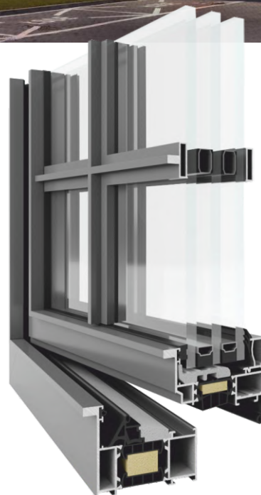
Photo: Grohman Factory, Łódź Design: AGG Architekci Grupa Grabowski Sp. z o.o., Łódź Aluminium manufacturer: OLI Sp. z o.o., Piotrków Trybunalski

The base of the system are aluminium structural sections with thermal separators and infills of high thermal insulation properties.